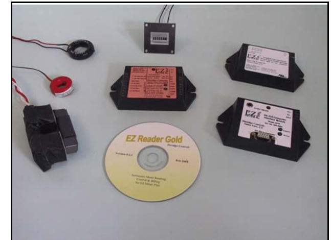
Yosemite Plus IO Meter with (clockwise from top) display counter with mounting plate, Power Line Interface, RS-232 Interface, EZ ReadIt Gold CD-ROM, split core CT, 200 amp CT, 100 amp CT.

Davidge Controls 583 N Refugio Rd Santa Ynez CA 93460 (800) 824-9696 (805) 688-9696